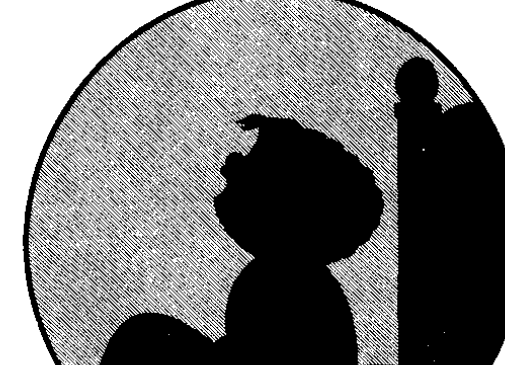
God, please let me make it to another comic strip by puberty.